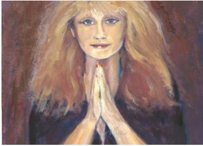
"Alexis: Self Portrait" oil on masonite Private Collection