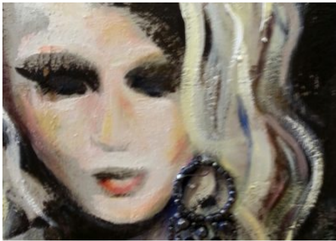
"Blonde with Earring" oil on masonite SOLD