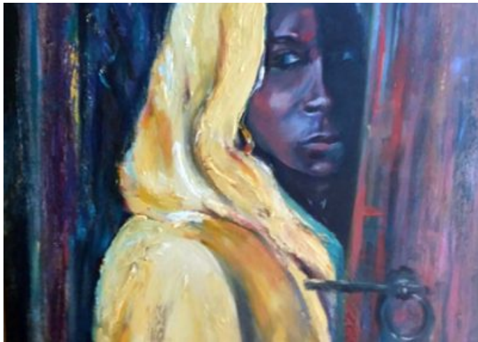
"Yellow Shroud" oil on masonite