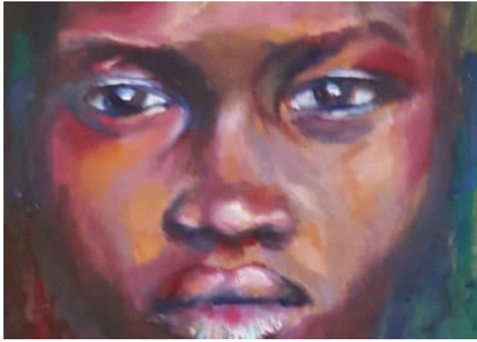
"Pensive" oil on masonite, offered @ The Wylie Art Gallery