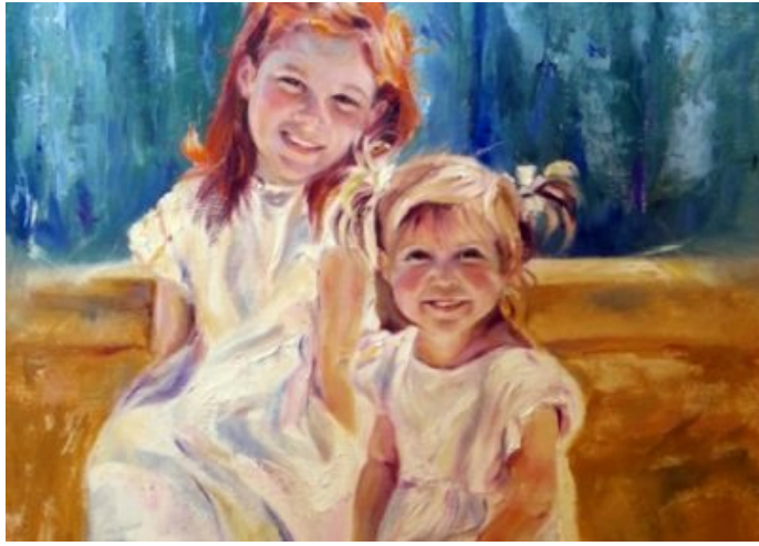
"The Hallman Sisters Portrait" oil on canvas SOLD