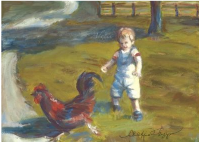
"Little Chicken Chaser" oil on canvas SOLD