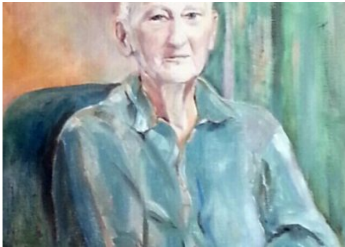
"Grandpa Bill" oil on canvas SOLD