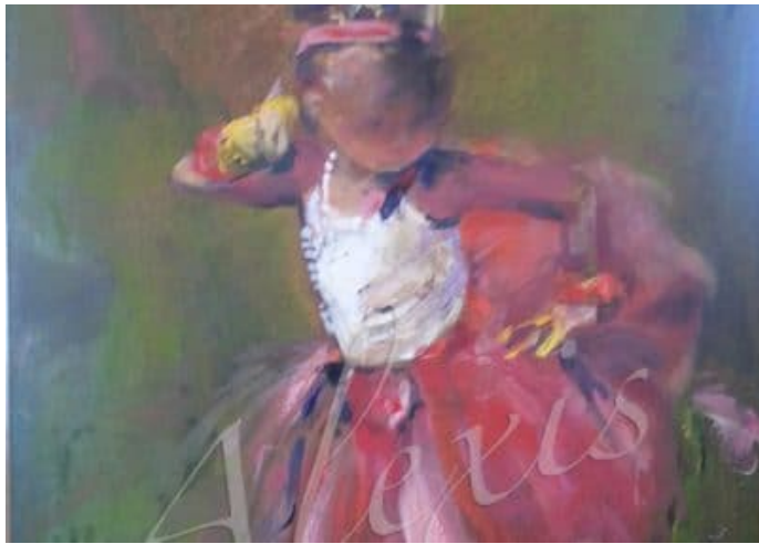
"Posing" oil on masonite SOLD