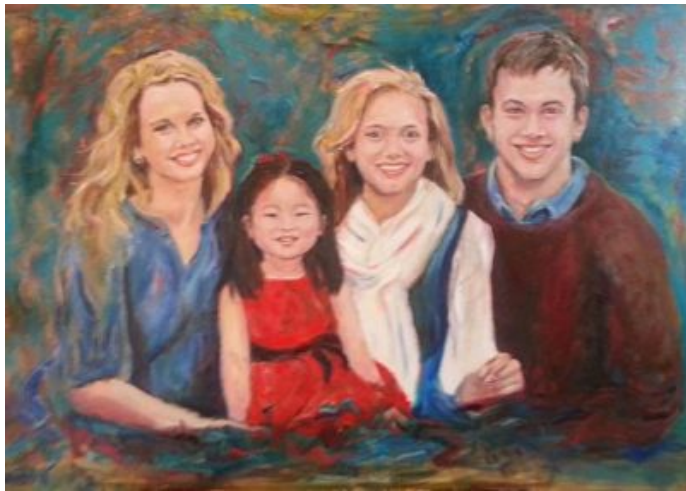
"Williams Family Portrait" oil on canvas SOLD