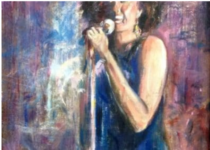
"Singing the Blues" oil on masonite SOLD