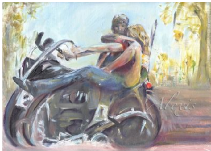
"Biker Babe." Oil on paper Private Collection