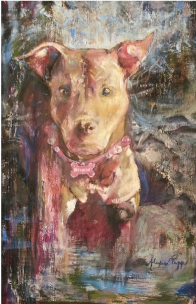
"Portrait of Tallulah" oil on masonite SOLD