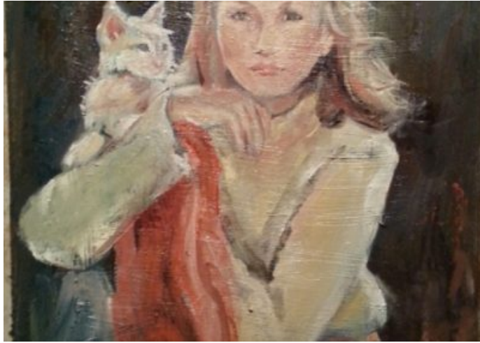
"Cuddling" oil and gesso on masonite